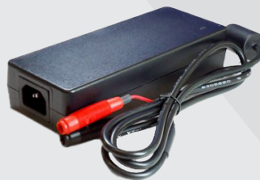
Power Source (B)